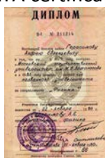
MSc. (Physics) diploma