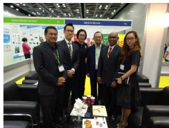
Trade Show Business Matching Asia ICM Resources Sdn Bhd