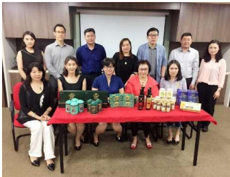
Product Launching for Non-Chinese Market China Tea Group