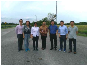
Land Deal Negotiation Client from P.R. China