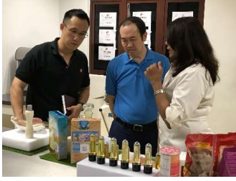
R&D Product Showcase COFCO Oils & Oilseeds