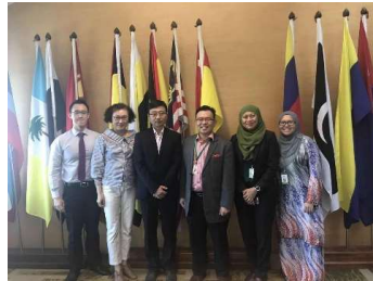
Collaboration Negotiation China Solid State Lighting Alliance