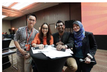
Company Event Bilingual Emcee Sime Darby Group