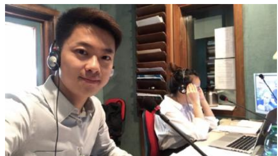
SI – UNFAO COFO24