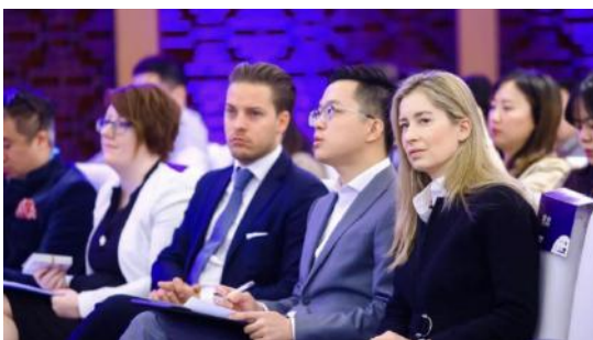
SI – Hungary Tourism Roadshow