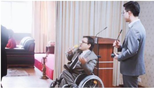
CI – Nepal Tourism and Investment Roadshow