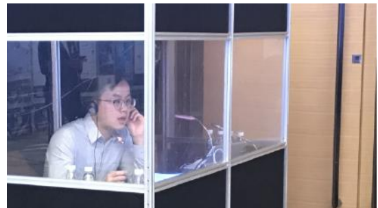
SI – Hospitality Purchase & Supply Congress