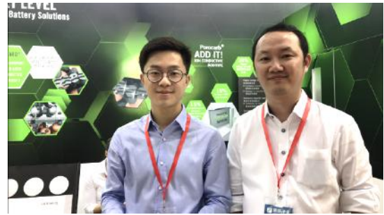
CI – China International Battery Fair