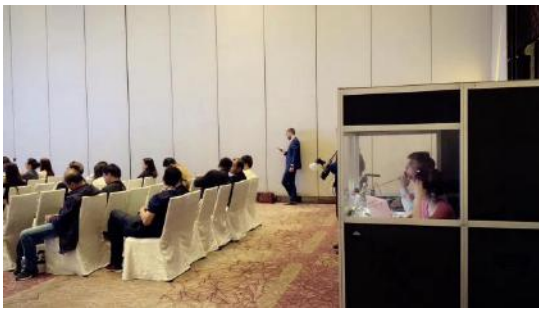
SI - 2019 FOCUS Future Oriented Construction of Universities and Schools