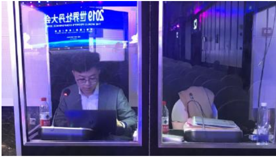
SI - World Peony's Conference