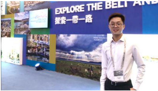
CI – Belt and Road Summit