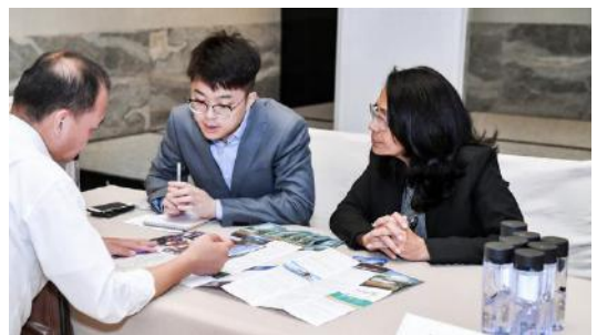
CI – Brazil Tourism Roadshow