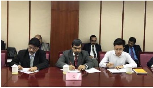
CI - SASAC Meeting with Indian Delegation