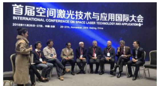
CI - International Conference on Space Laser Technology and Application