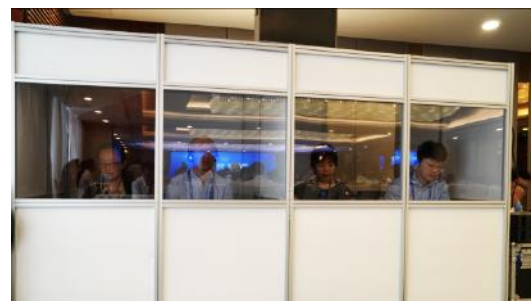
SI - International Medical Innovation and Cooperation Forum