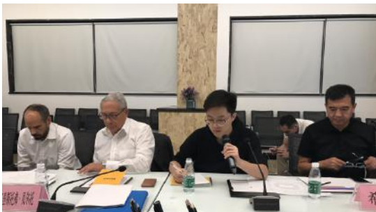
CI – FIBA Preparatory Meeting