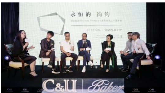
SI – Baker New Product Release