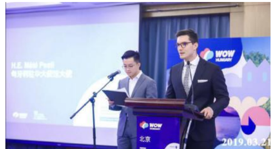
CI – Hungary Tourism Roadshow