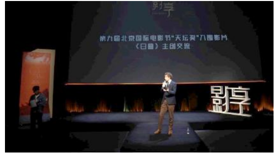
CI – Beijing International Film Festival