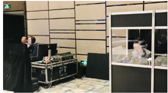
SI – Microsoft Contract Signing Ceremony