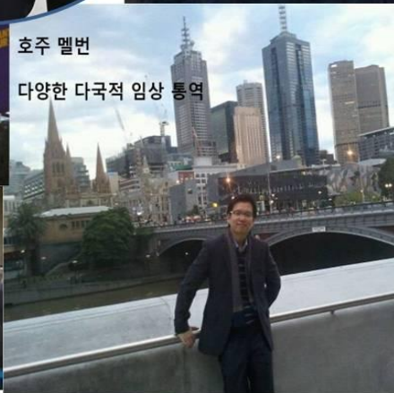
호주 멜번 다양한 다국적 임상 통역