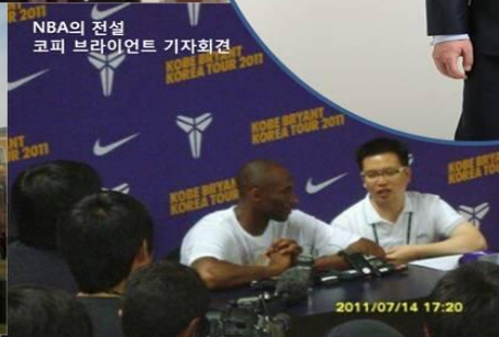
NBA의 전설 코피 브라이언트 기자회견