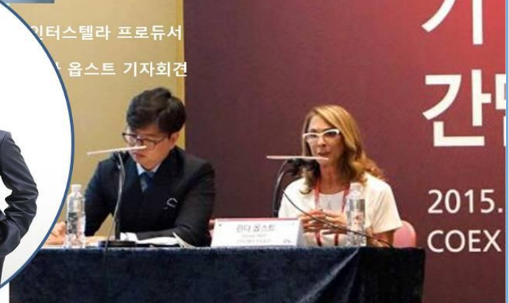
인터스텔라 프로듀서 옵스트 기자회견