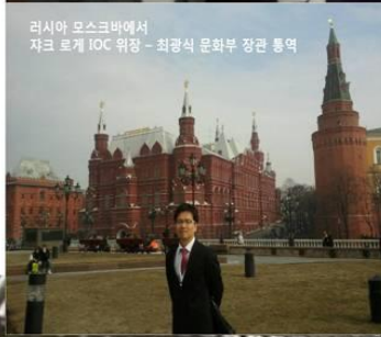
러시아 모스크바에서 자크 로게 IOC 위원 - 최광식 문화부 장관 통역