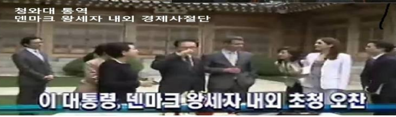
청와대 통역 덴마크 왕세자 내외 경제사절단