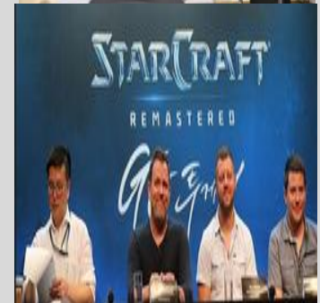
Symantec APJ meeting Brave Coin User Conference Star Craft Press Conference