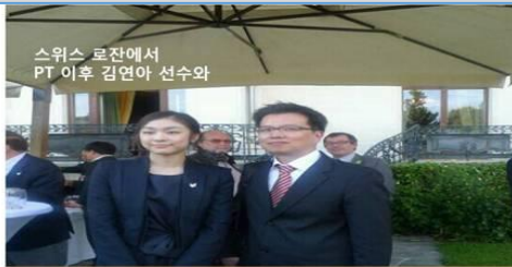
스위스 로잔에서 PT 이후 김연아 선수와